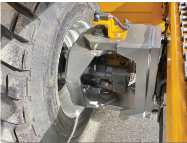
Multi function steering